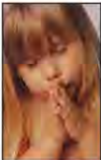
“The Lord is far from the wicked, but He hears the prayer of the righteous” Proverbs 15:19